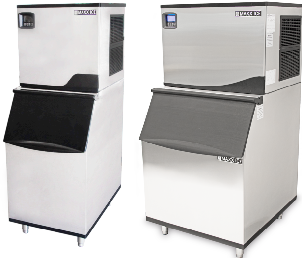
MIB280N & MIB430N shown with modular ice maker heads (sold separately)

These ice maker storage bins are designed to fit perfectly with the Maxx Ice series of 22" and 30" modular ice makers. Gravity Drain is required.